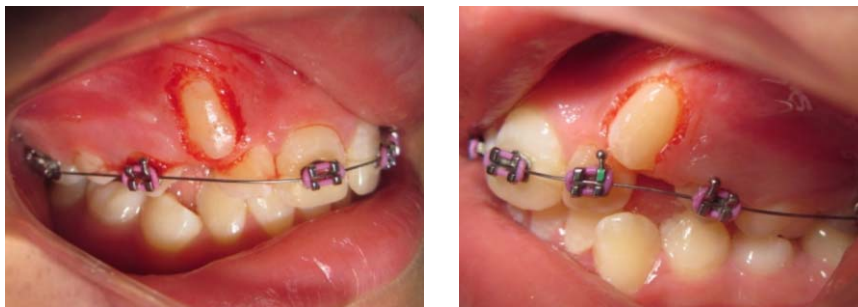
Fig. 2. Laser-assisted exposure of 13 and 23 teeth