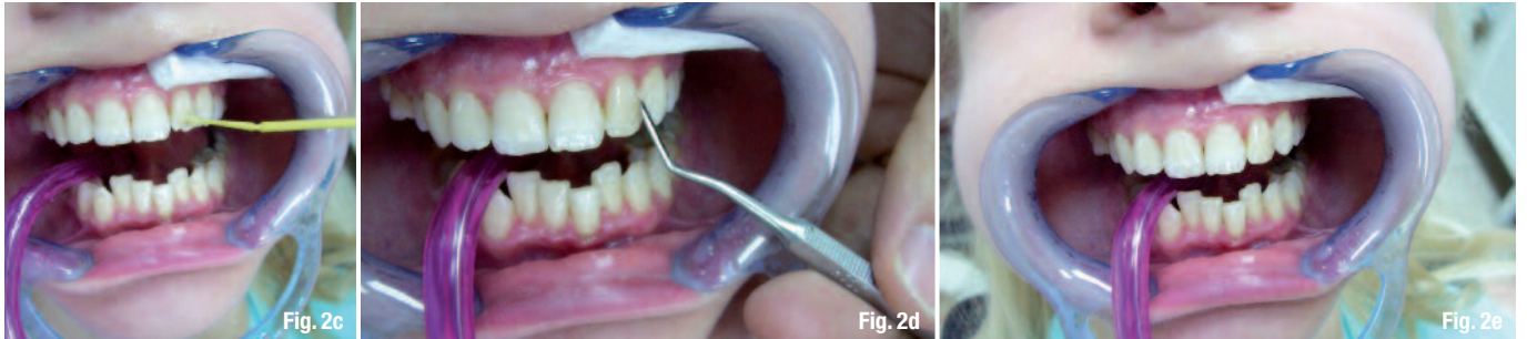
Fig. 2 c & d Adhesive agent application and final restoration view.

removal of hypomineralized enamel, rather than the differential etching patterns seen in the unaffected control enamel. 7,9 This etching of a less organized enamel structure may result in a pattern that is not the classic etched pattern, which may have a detrimental effect on bonding between the restorative/adhesive materials and the affected enamel. 7 For that reason the dentist would like to find an alternative procedure for preparing the hypoplastic enamel. One of the effective methods may be to etch the hypoplastic enamel with Er:YAG lasers.